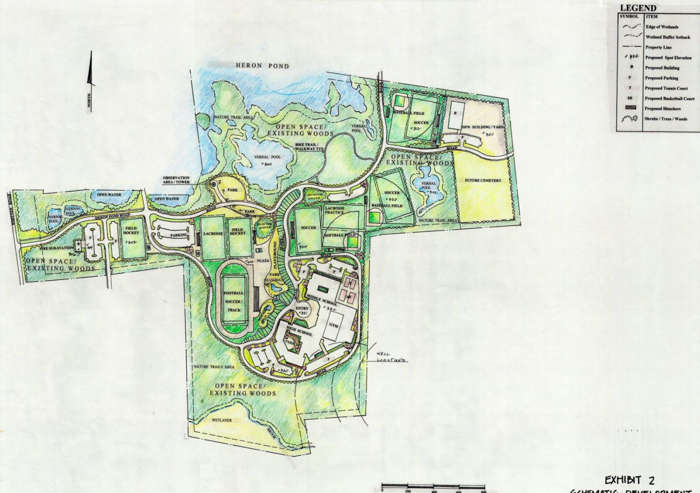
EXHIBIT 2 SCHEMATIC DEVELOPMENT PLAN